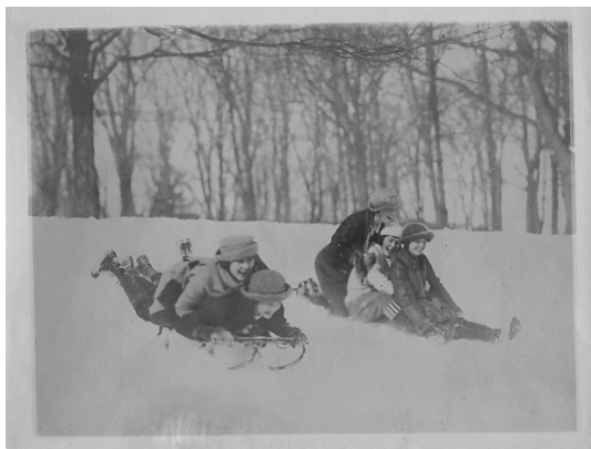
MHC Girls at Play, circa 1925