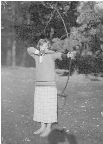
Champion MHC Archer